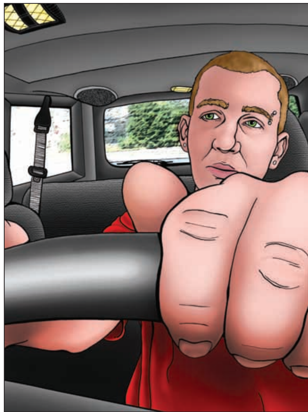
Illustration by Jonathan McGinnis

A bottle of water and a snack (if your teacher allows it) A book that interests you for when you are finished with the test I hope these instructions help you to get prepared for the big day! Good luck and try your best!