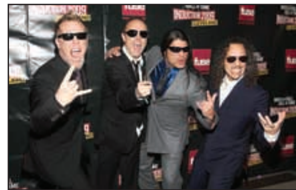
Rock and Roll Hall of Fame and Museum

This sculpture of the Division Bell comes from the Pink Floyd album of the same title.