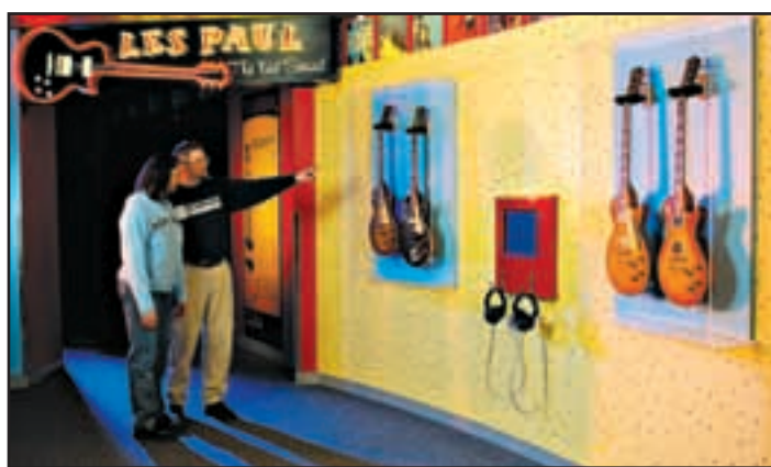
Rock and Roll Hall of Fame and Museum

Metallica poses for the cameras before being inducted in the 2009 class of Hall honorees.