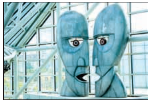
Rock and Roll Hall of Fame and Museum

No matter what criticism there is, being inducted into the Rock and Roll Hall of Fame is a huge honor reserved for those who have affected people musically. In the words of John Lennon, "I don't know which will go first: Christianity or rock 'n' roll."