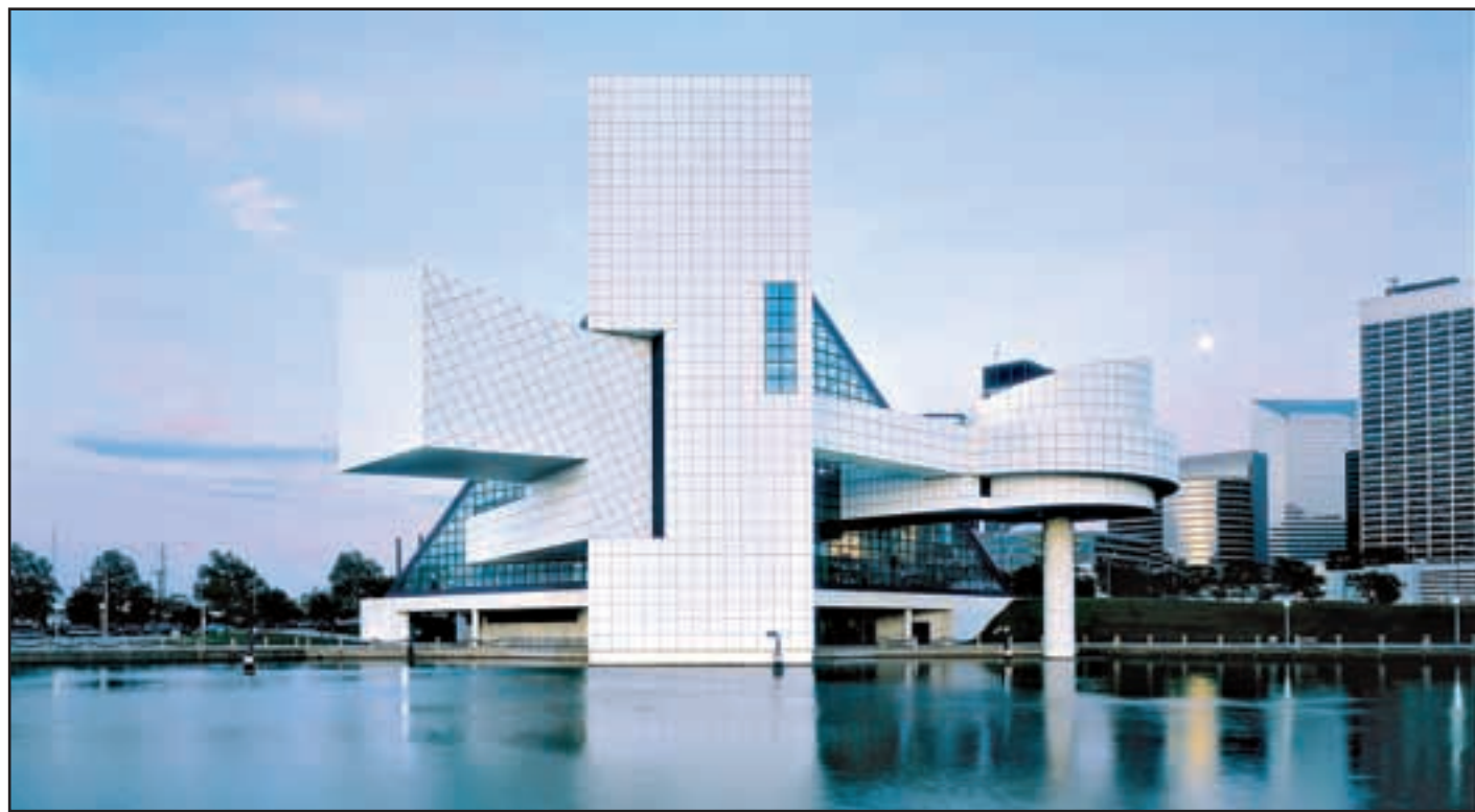
Rock and Roll Hall of Fame and Museum

Non-Performers are people who work behind the scenes in the music industry. This includes songwriters, producers and record label executives. Some of the more