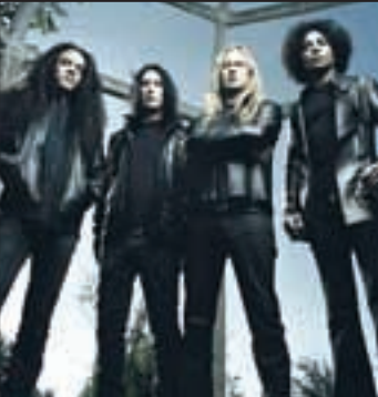
AP file photo

SOURCE: Nielsen SoundScan, Inc., Billboard/AP